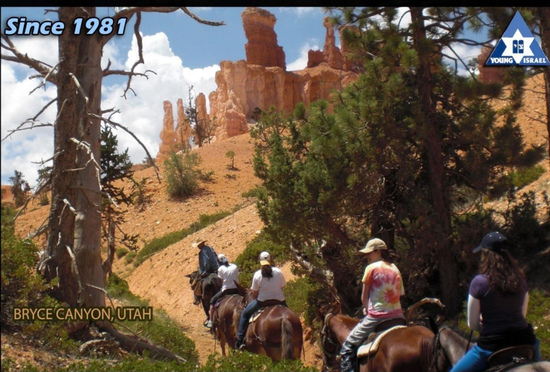
BRYCE CANYON, UTAH